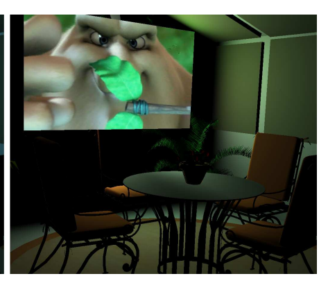
Figure 1: An indoor garden illuminated solely by a large area light source displaying a video. Different frames from the video produce illumination of varying intensity and colors. The above figure displays three examples.